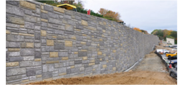
Smithsonian National Zoo Retaining Wall; DC