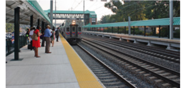
MARC Halethorpe Train Station; Baltimore, MD